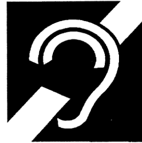
Symbol of Access for Hearing Loss